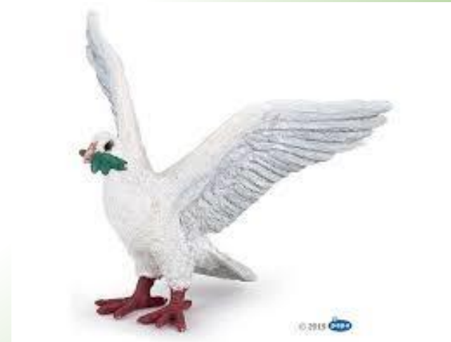
Prince of Peace